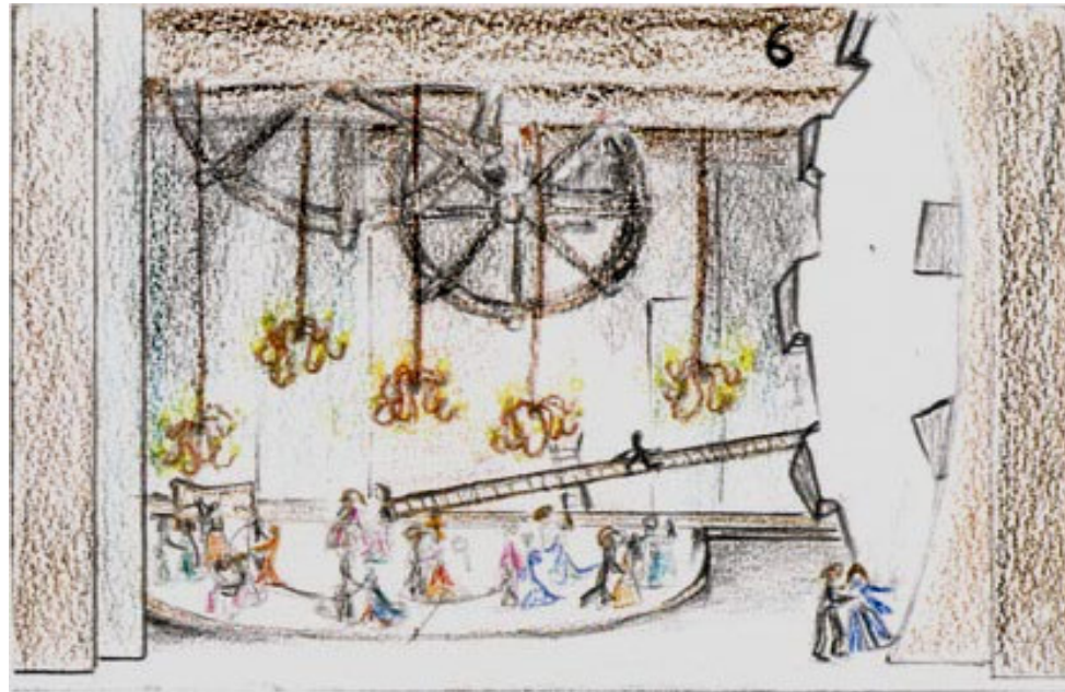
II° Atto – Final Waltz, Cochenille frontstage with female chorus singer, Coppelius on suspended stage, Hoffmann and Olympia centerstage