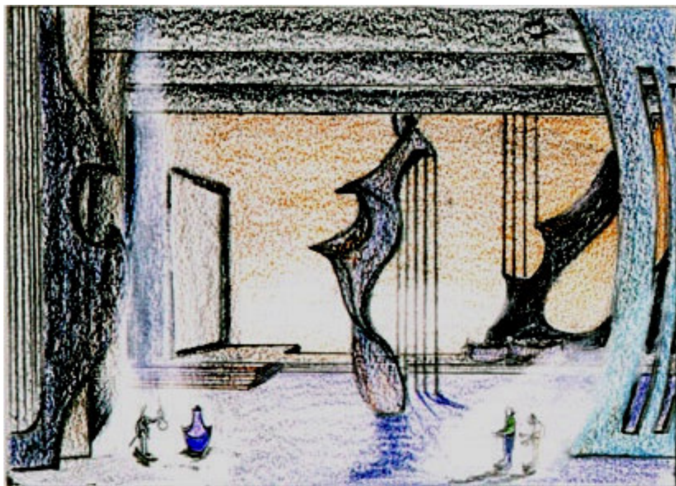
III° Atto –Nicklausse's, Hoffmann and Nicklausse stageright, first violin stage left setting on part of scenery, frontstage